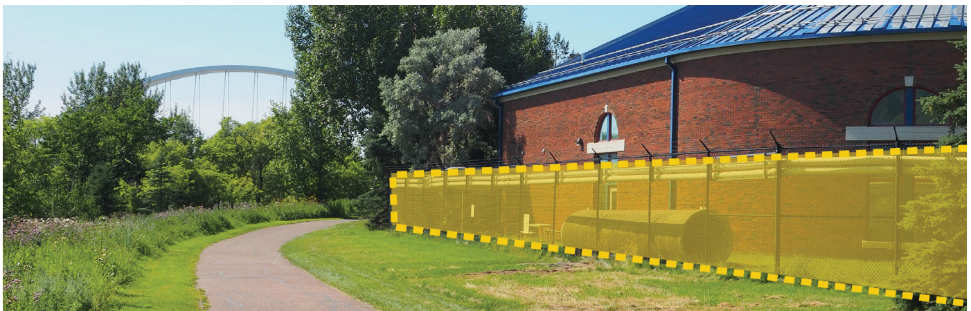
Looking east along the river valley recreational trail. The yellow shaded area shows the approximate height of the flood barrier required to protect the Rossdale Water Treatment Plant.. See Section C on the next page for more details.

Using a combination of earthen embankments and flood walls can help minimize impacts to existing treed areas. Design concepts for discussion are being coordinated with other initiatives in Rossdale, such as the City's Touch the Water Promenade project, Ribbon of Green master plan, River Crossing project and the potential Prairie Sky Gondola team, to ensure that the location and design of these barriers coordinate with the various plans underway in the area.