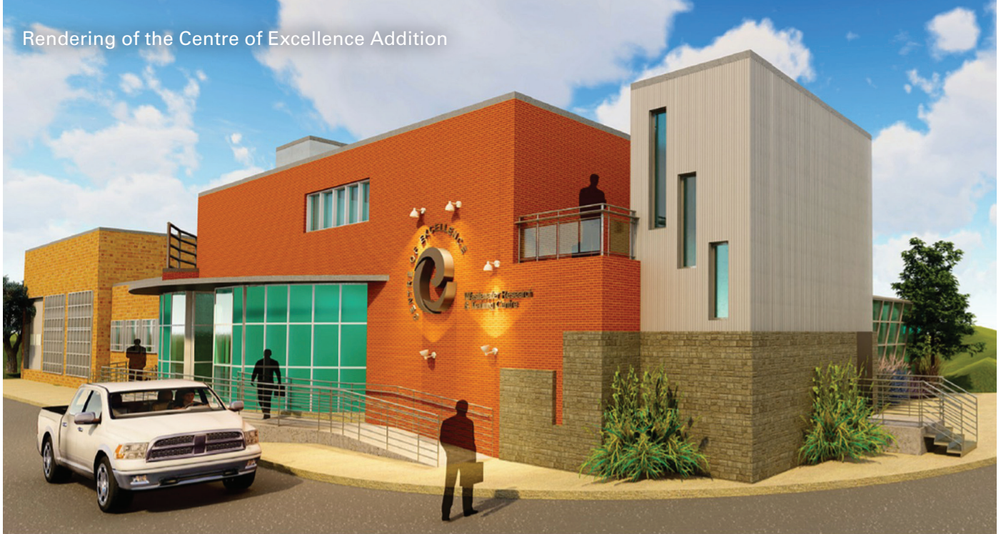
Rendering of the Centre of Excellence Addition

This project will also include renovations to the main floor of the Centre of Excellence and a new control room. As shown in the rendering below, the conceptual design of the addition has been engineered to align with the aesthetic of the Centre of Excellence and other buildings on site.