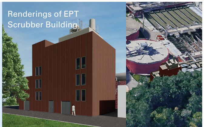
Renderings of EPT Scrubber Building

As mentioned in our February newsletter, we are installing two additional Enhanced Primary Treatment (EPT) Scrubbers in a new building shown in the rendering to the right. Construction has started on this project and we anticipate that the building will be constructed by this fall. We had to remove three trees within our fenceline, which will be replaced in alignment with our Vegetation Plan for the Gold Bar Wastewater Treatment Plant (GBWWTP).