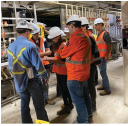
Israeli delegation tours Gold Bar.