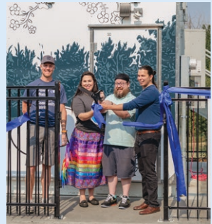
Celebrating the Indigenous art installation at the Gold Bar Park AAQMS

In August, staff gave the pedestrian walkway on the northeast side of the plant a burst of colour! This walkway is a visual show of support for Pride, and creates a space for inclusivity and diversity at Gold Bar.