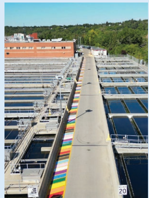
Pride Walkway at Gold Bar